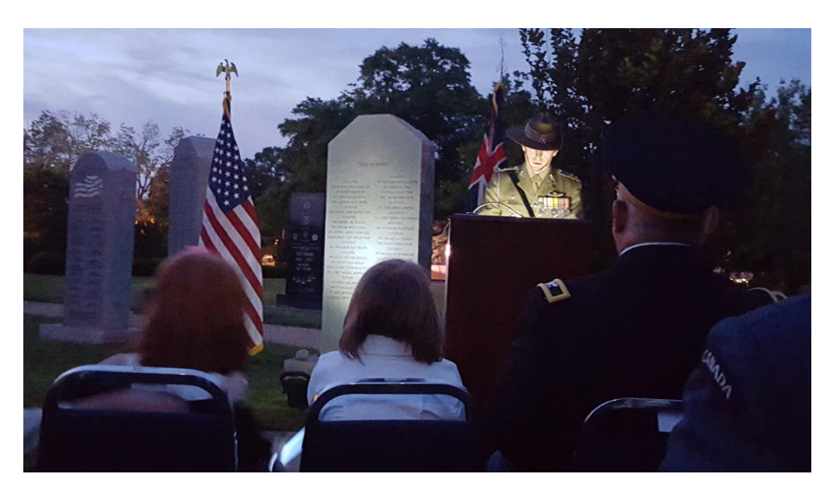
Anzac Day Address