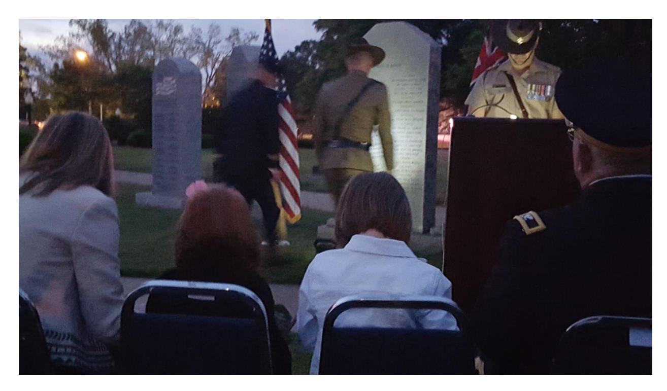
Laying of the wreath in Memory of the Fallen