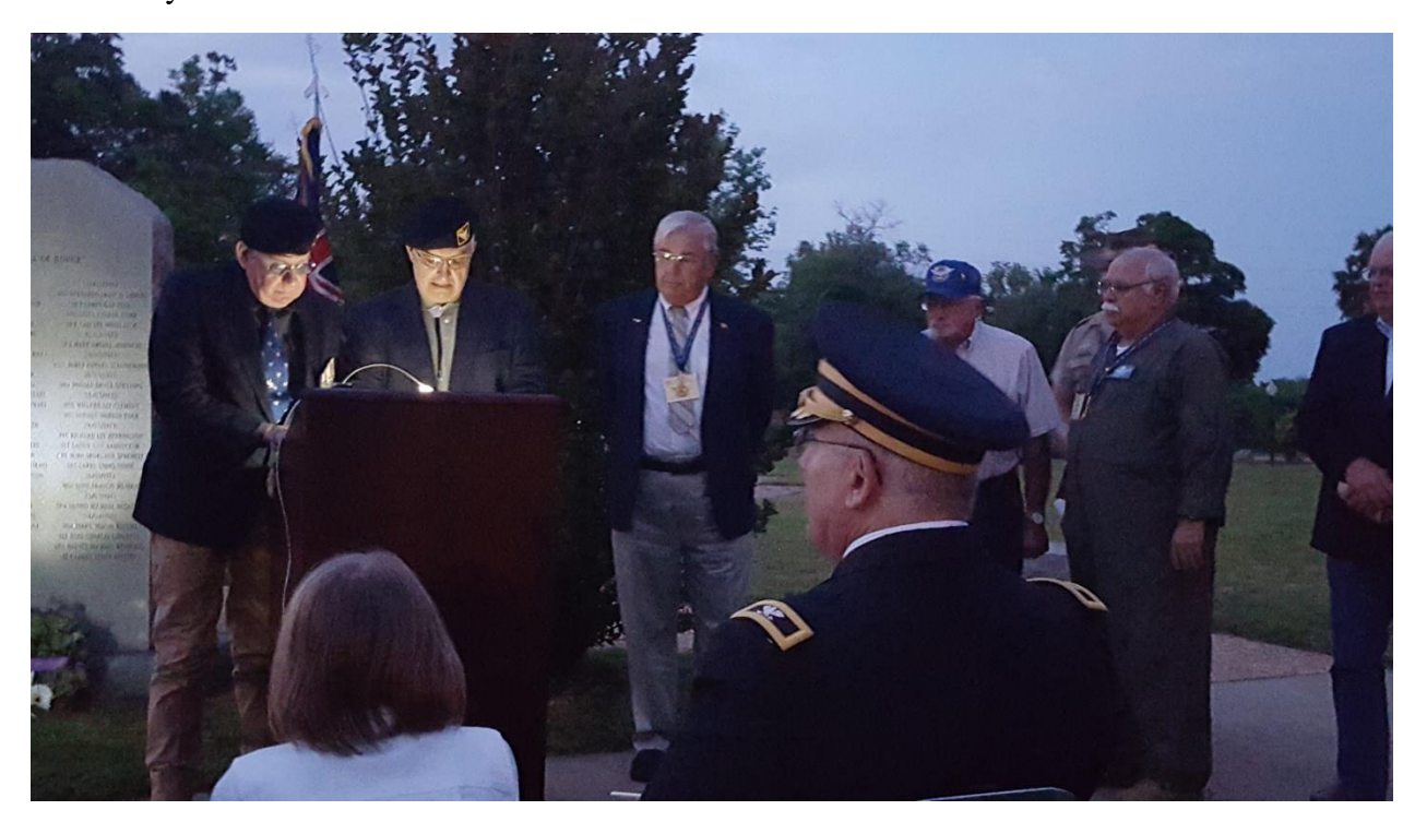
Reading of the combat aviator Honor Roll