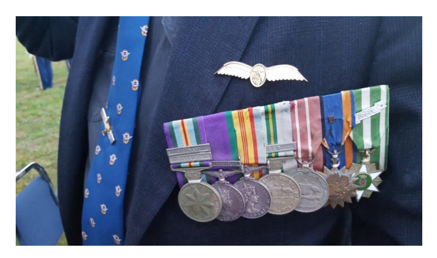
Forgotten Hero Wings (For service to the 135<sup>th</sup>)

In addition to the memorial service there was a casual gathering at Mother Rucker's on Sunday afternoon 24 April 2016, and a hanger tour in Ozark at the Friends of Army Aviation Hanger followed by a lunch. We would like to thank the 135<sup>th</sup> AHC EMUs and all those who served in Vietnam.